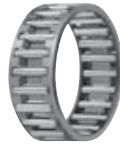
High carbon steel cage type