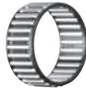
Synthetic resin cage type